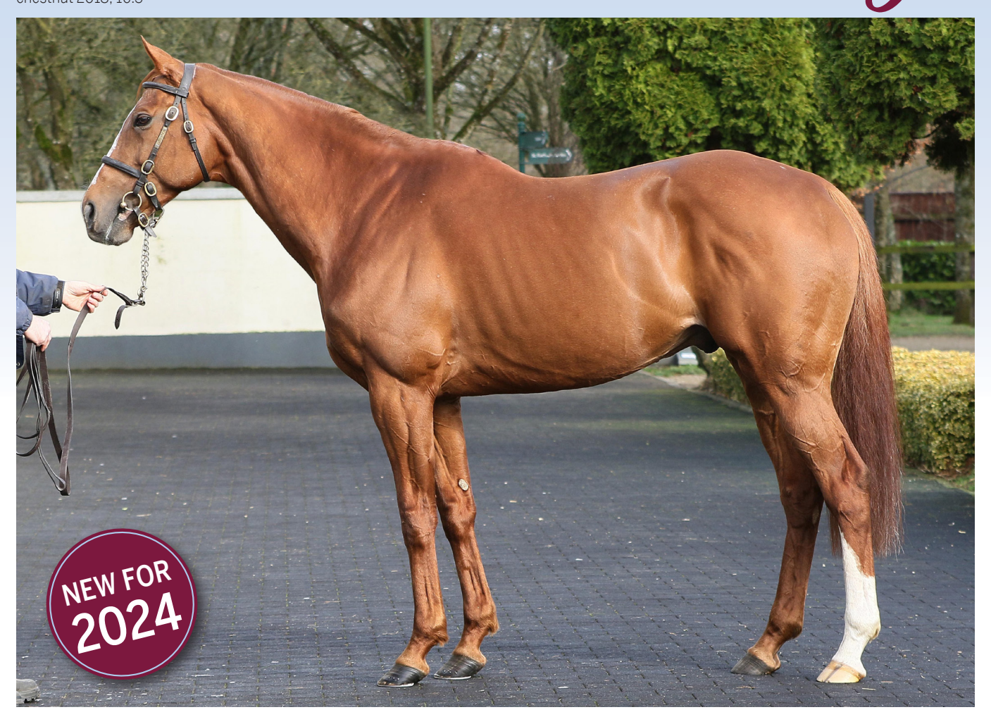
GR.1 WINNING 2YO, GR.1 AND CLASSIC-WINNING 3YO