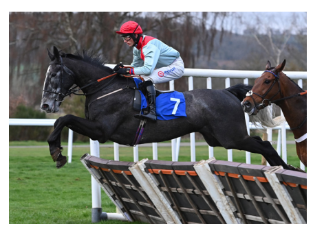
DUKE OF MORAVIA Four places from first five runs. Bred by Kevin Blake.

Sire of almost 70% winners / placed to runners