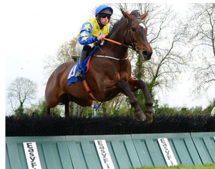
OSTEND Maiden hurdle winner. Bred by Framont Ltd. 'He travelled strongly and put his seal on the race after two out' racingpost.com