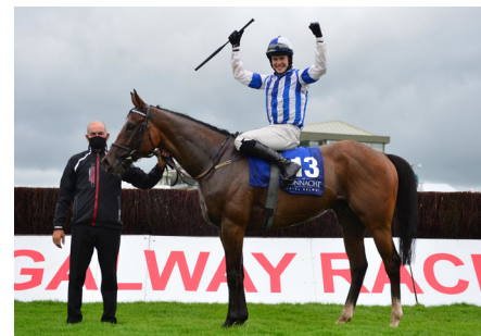
COLTOR , Four-time winner and fifth in the Fred Winter at Cheltenham