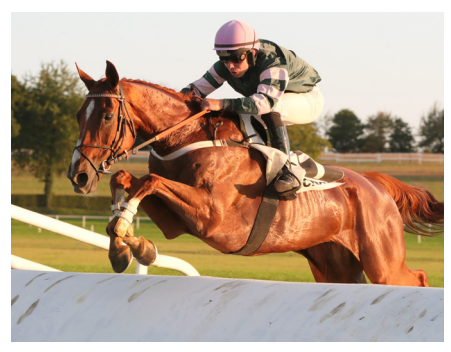
DORALOU DES BORDES Winner of LR Prix Chriseti (Cross Country Chase) at Craon