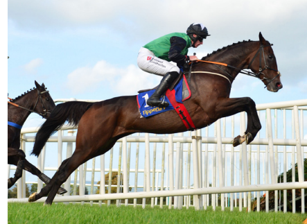
ROYAL EAGLE Five-time winner 'came here in good form and made light work of defying top-weight. She is likely to carry on progressing over hurdles.' Racing Post after Tramore win, August 2023