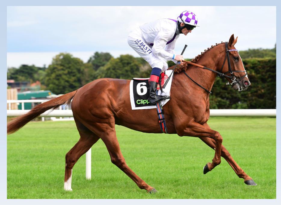
Gr.1 winning 2YO, Gr.1 and Classic-winning 3YO from a deep black-type family