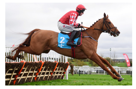
PIED PIPER (by New Approach) Multiple Gr.2 winner