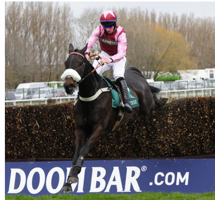
ARZAL Winner of Gr.1 Manifesto Novices' Chase, also twice Gr.2 placed